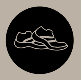
WALK Just a short walk to wholefoods, restaurants, parks